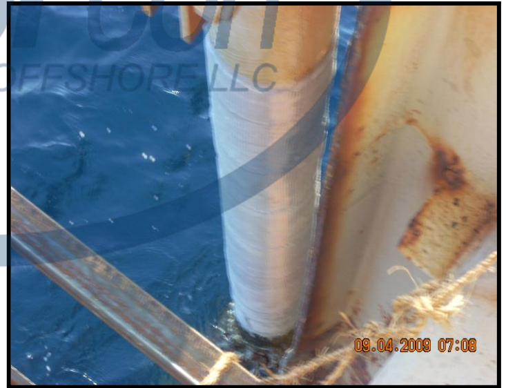
Completed Armor Plate