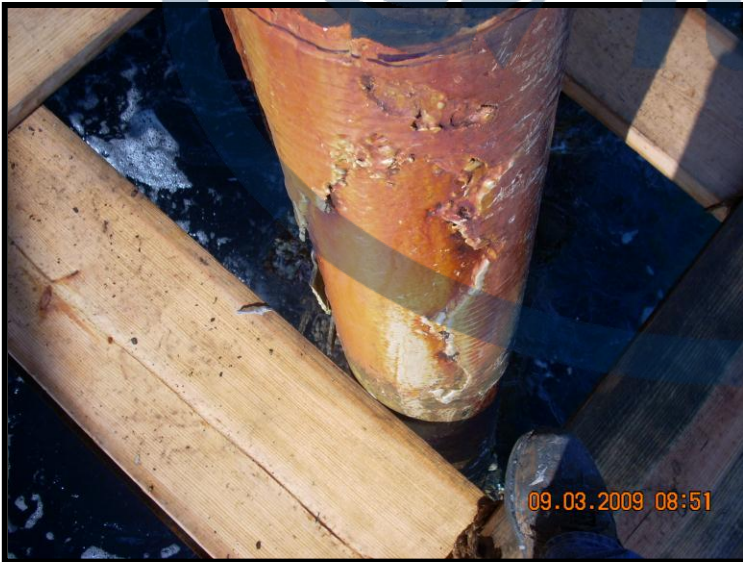
Waterline Before Repair