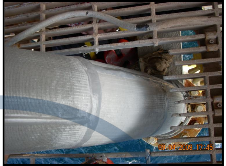
Radius After Repair