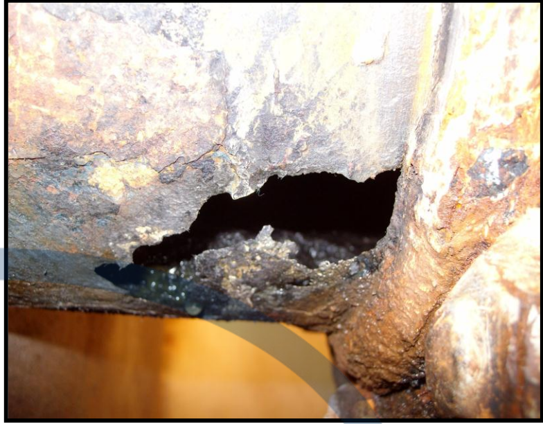
After Surface Preparation