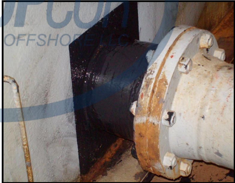
Completed RiserWrap Installation over Repair Area.