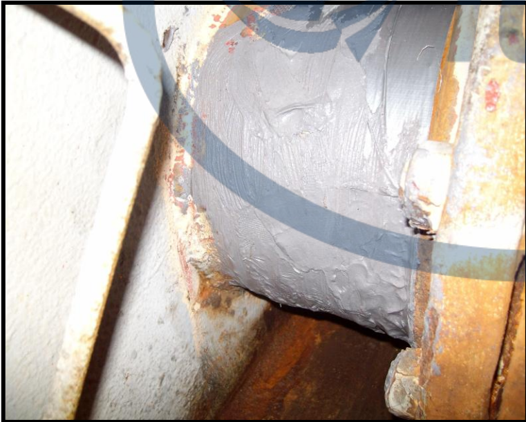
Metalized Putty Over Repair Area